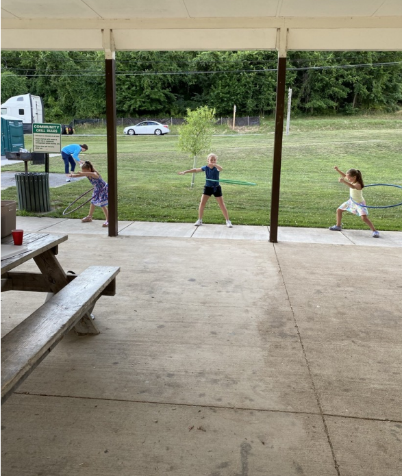
Some of the Girls having fun at the GEMS picnic in June 2024