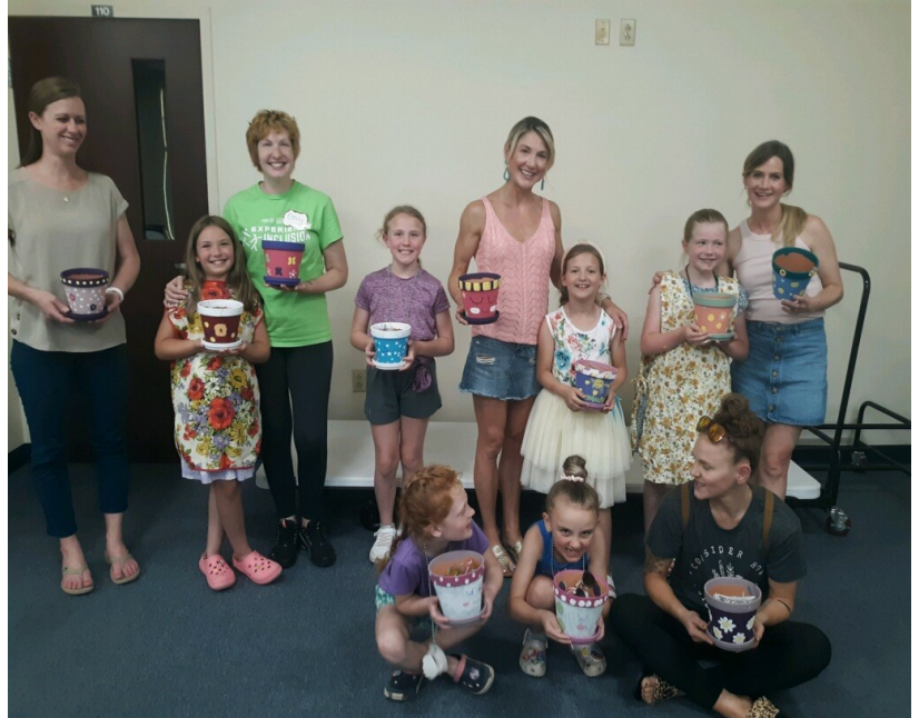
GEMS moms and daughters